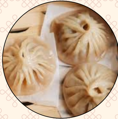
Mini Bun (6pc) $7.99