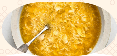
Egg Drop Soup