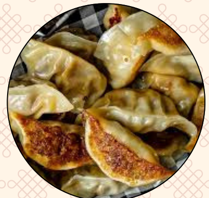
Potsticker (6pc) $8.99