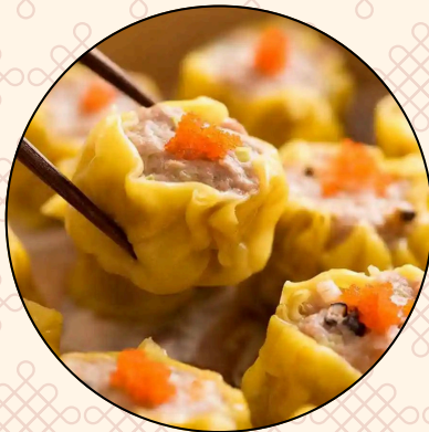
Shu Mai (5pc) $7.99