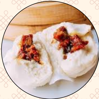
BBQ Pork Bun (3pc) $7.99