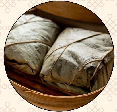
Sweet Rice in Lotus Leaf (2pc) $7.99