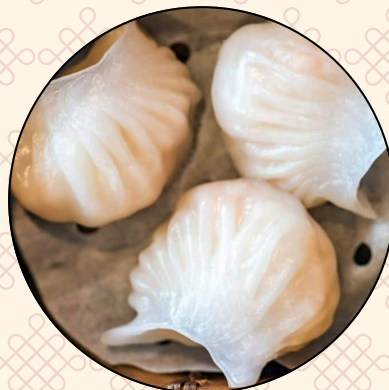
Shrimp Dumpling (6pc) $7.99